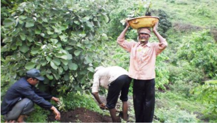
Planting saplings at Khirkhund Bujruk, survey no 5