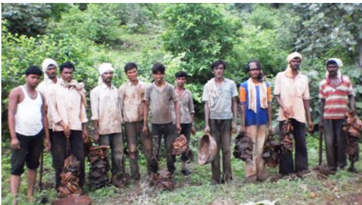
Team poses with plastic wraps of saplings at Khirkhund Bujruk