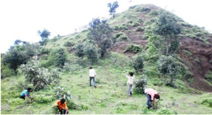
Digging pits at Khirkhund Khurd, Survey no 34