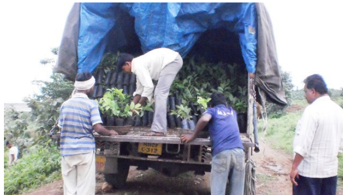
Unloading of saplings at Khirkhund Bujruk

Payments to villagers have been made for work completed (saplings planted) till July 31.