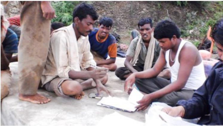
Payment being made at Khirkhund Bujruk